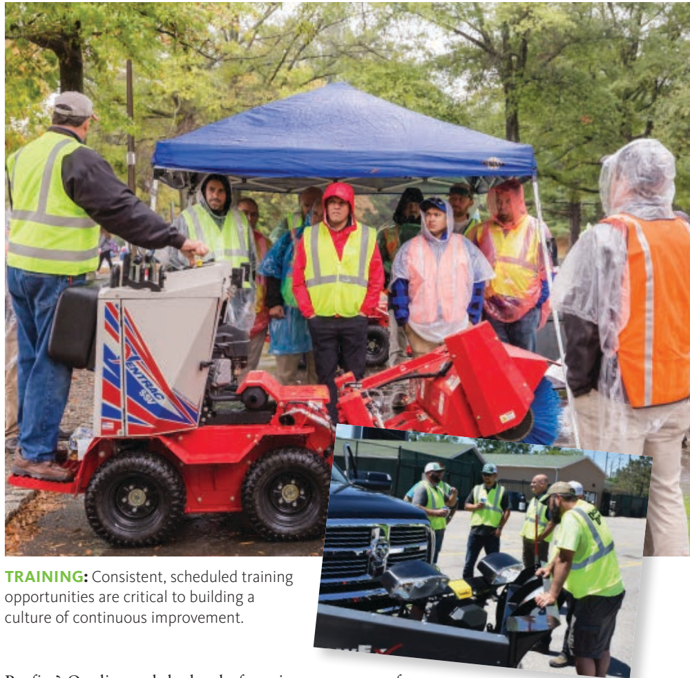
TRAINING: Consistent, scheduled training opportunities are critical to building a culture of continuous improvement.

How do we change? First, we need to ask the question: What would be worth changing for the positive?